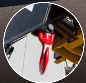
8. LED BOOM WORK LIGHTS AND LIFT HOOK