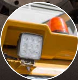
5. FRONT AND REAR LED CAB LIGHTS AND BEACON