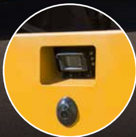
6. BACKUP CAMERA AND REVERSE SENSING SYSTEM