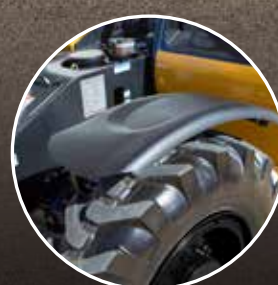
4. FULL 4-WHEEL FENDER PACKAGE