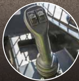
3. SINGLE, MULTI- FUNCTION JOYSTICK CONTROLS