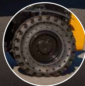
7. CUSHIONED SOLID TIRES